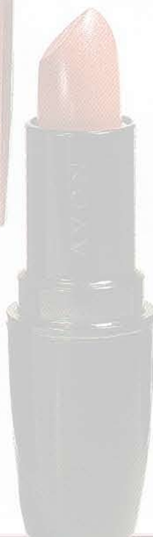
Avon Ultra Color Rich lipstick in Posy Pink, $7, avon.com

L&S STYLE TIP "The easiest way to select a natural-looking pink lipstick like Blake's is to match it to the color of your gums," advises Bodge.