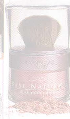
L'Oréal Paris Bare Naturals Gentle Mineral Blush in Soft Rose, $15, Walgreens

Do it: Smile, then apply a powder blush in a circular motion on the apple of each cheek.