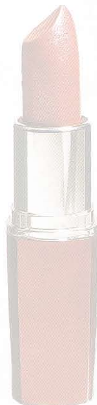
Maybelline Moisture Extreme Lipcolour in Wine on Ice, $6, drugstore.com

Do it: Apply color to both top and bottom lips, blot, then reapply. "It doubles the wear," says Bodge.