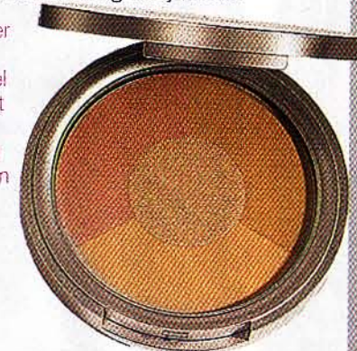
Me by (Me)zhgan Cheeky (Me) Multicolor Blush in Twenty Four Seven (Me), $45, mebymezhgan.com

Shimmer bronzer that's used all over the face looks too shiny. Instead, apply it just on the cheeks, like Hayden, to look radiant.