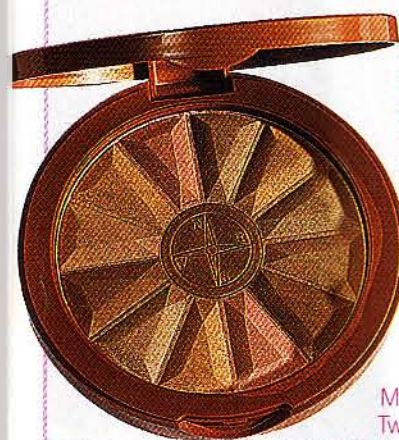
Lancaster Sunlight Carrousel Compact Powder, $38, skinstore.com

Do it: Apply bronzer by tracing the shape of a 3 on the right side of the face and a reverse 3 on the left. Start on the forehead and sweep inward along the cheekbone and then down along the jawline.