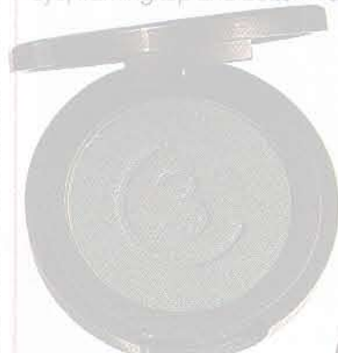
Three Custom Color Specialists Cool Smoke Eye Shadow, $20, threecustom.com

Do it: Line inside rims with a dark-gray pencil. Lightly smudge metallic-gray shadow around the eye, framing top and bottom lids.